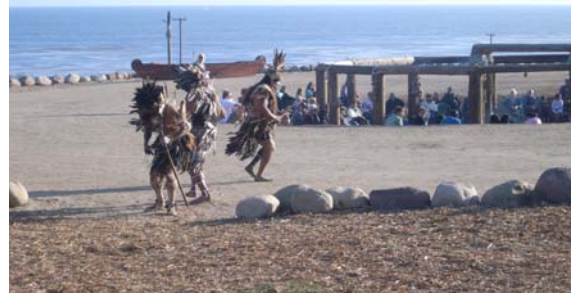
Chumash elders deliver Chumash maritime culture and stewardship education program at Wishtoyo's Discovery Village

Wishtoyo's active engagement of its student audience goes beyond their participation in songs and story telling. Our programs present a window in time of Chumash Maritime life – a past and present living and breathing presentation from a Chumash Village overlooking Point Dume, the Channel Islands, and their marine waters, where whales and dolphins are often visible swimming, migrating, or feeding. We share with the children how we fished in the Channel Islands waters and coastal lagoons from our plank canoes (tomols) with abalone fish hooks and with nets made of natural materials from local rivers. Dressing in our traditional dolphin dance and seaweed dance regalia, we share our creation story about the rainbow bridge that was made to provide a passage way from the Channel Islands to the mainland, and how some of our people looked down from the bridge, and fell into the ocean below but were saved and turned into dolphins ("Alulkoy", which means blue dolphin).