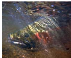
The California Condor and Southern California Steelhead, critical natural cultural resources for the Chumash People, are two of many endangered species Wishtoyo uses law, advocacy, and restoration projects to protect.