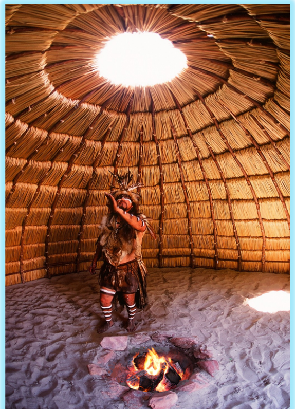
Mati Waiya conducting ceremony in the Chumash Discovery Village's Hummingbird Ap