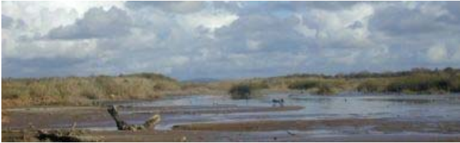
The Santa Clara River Estuary