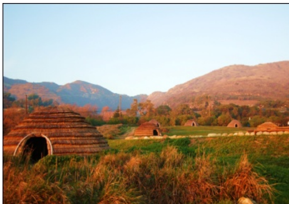
Wishtoyo's Chumash Discovery Village - "Humaliwu"