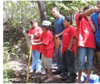
Over 50 Native Youth from the Chumash Tribe, Lone Pine Paiute-Shoshone Reservation & Owens Valley participated in Wishtoyo's 4 Day Tribal Wave Youth Camp at the Village, where they learned about marine stewardship and water quality monitoring, and experienced intercultural exchange and surfing lessons.