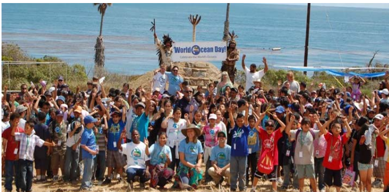
World Oceans Day '09 (left) & '10 (right) at the Village